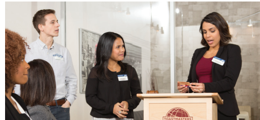
Table Topics. During Table Topics, all attendees have an opportunity to present one- to two-minute impromptu talks. This is often the most challenging and fun part of your meeting.

The order and length of these segments may differ from club to club. The length of a club meeting often determines the amount of time for each segment.