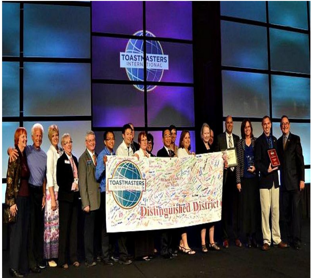
Table Topics Speech Contest